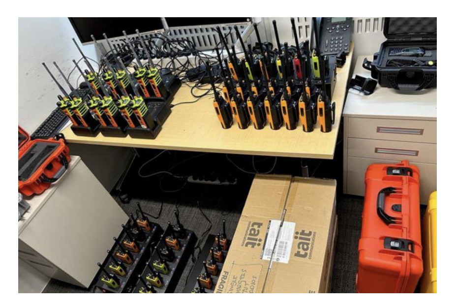
Figure 2 VHF Handheld radios loaned by AREC awaiting deployment to evacuation centres.

AREC operations and preparation were activated on Wednesday, 8th of February, where actions commenced on Sunday, the 12th of February, and continued through to Thursday, the 16th of February.