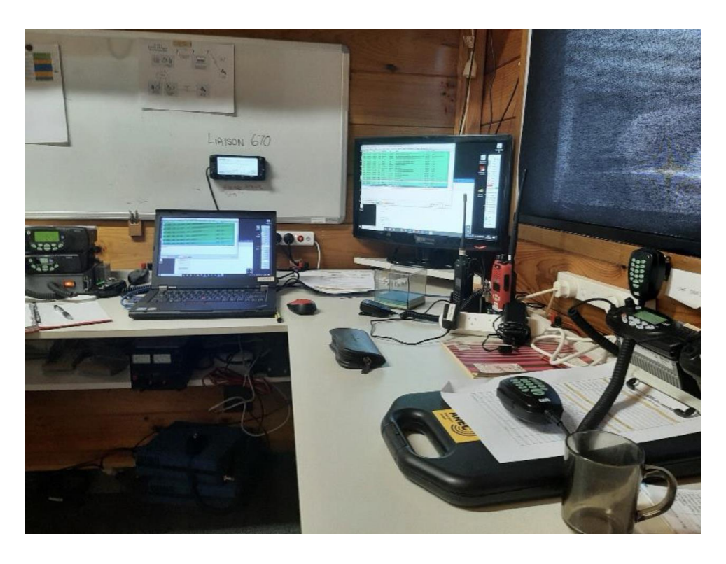
Figure 4 Main Operating area North Shore Comms Base

Auckland ECC operations manager Josie Beswick passes on her thanks and congratulations for the outstanding service provided by AREC volunteers, and that is echoed by feedback from the Community groups and Civil Defence evacuation centres around the region, who were kept in touch when the power and phones were down and things looked gloomy.